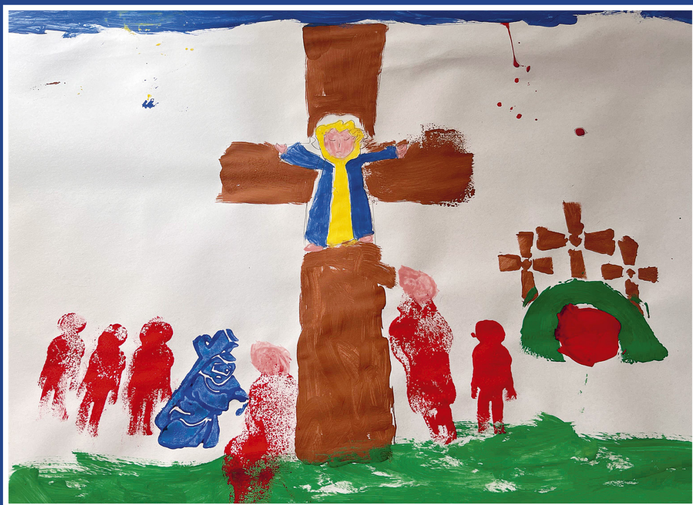
Image from the Easter Workshop frieze created by the young people of Fakenham. See the whole artwork in church.